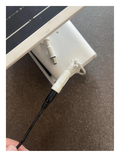
After fully charging, unplug the external power cord and connect it back to the original solar panel wiring.