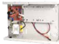
995200PE3 small enclosure shown